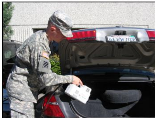
Figure 1- Using the zNose at a VCP.

EST's electronic nose, the zNose®, can be used for the detection and identification of explosives, narcotics, and other contraband at maritime ports, the screening for a variety of explosive compounds and chemical agents at vehicle check points (VCP), on departing passengers and luggage at airports, the screening of vehicles and shipments at entry and exit points. It can also be used to detect hazardous volatile organic compounds in the HVAC system or ambient air of an airport terminal.