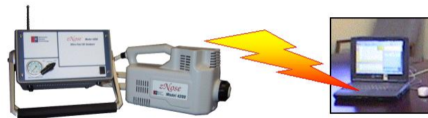
Figure 2- Linking zNoses within a wireless network.

The zNose can operate within a wireless network using either Wi-fi, or bluetooth, or RF modems with ranges up to 1 mile. It can also be remotely linked using an Internet connection. Currently the most recent model is completely mobile using a built in connection. The company provides online support for all its products using an internet network connection. This capability could be used within an airport security system to provide over site by a central monitoring station as well as updating of new threat signatures to every zNose within the facility.